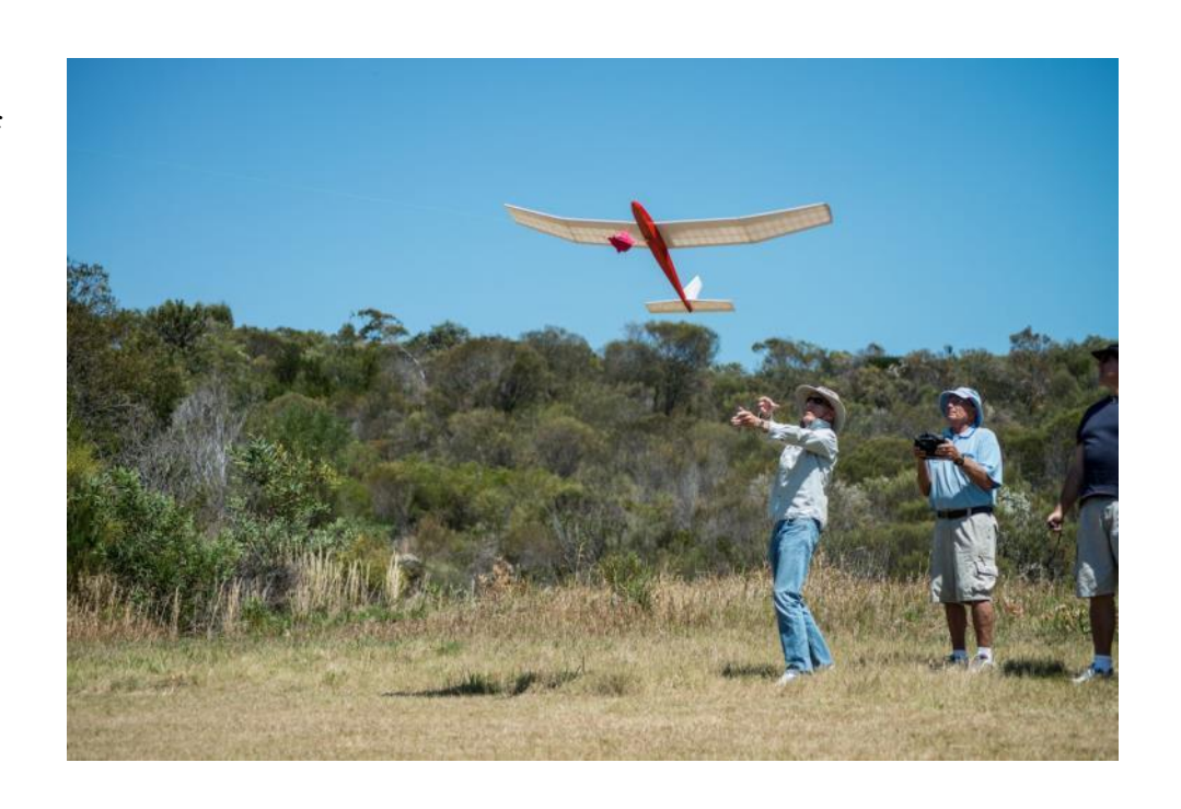
And DM launches for DF in Thermal Gliding

You can never get away from the paparazzi!