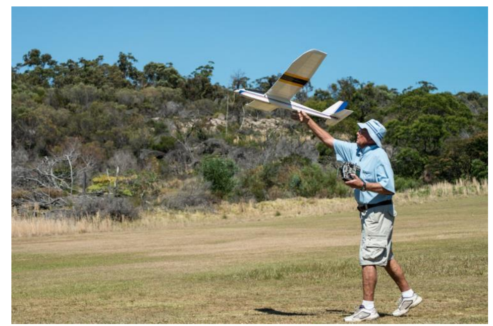
Dave F self launches but