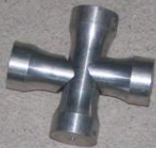
Rotor head /blade holder