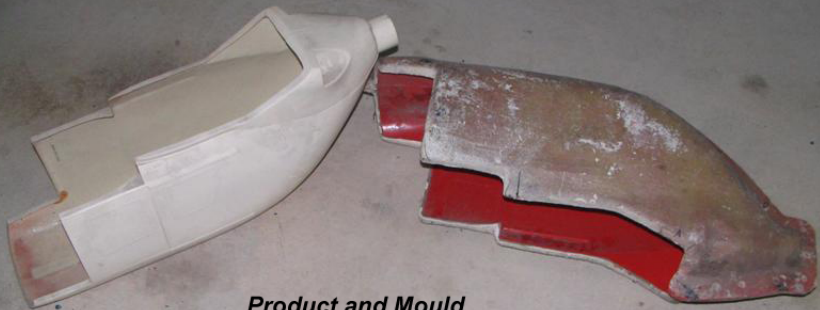
Product and Mould